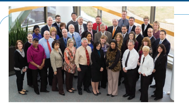
NJM's commercial lines staff, above, includes 15 loss prevention representatives.