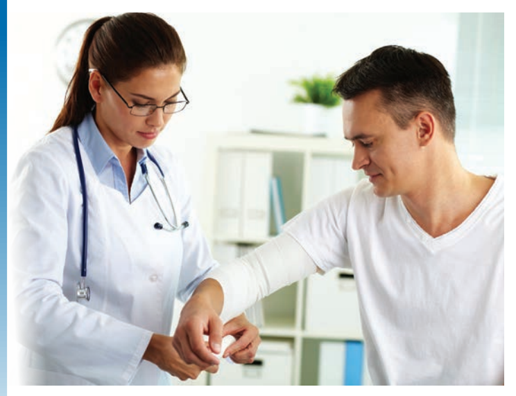
NJM's extensive network of care providers benefits injured workers and their employers.

The upgrades typify the NJM value proposition — enhancing service while consistently exercising prudent stewardship of policyholder funds.