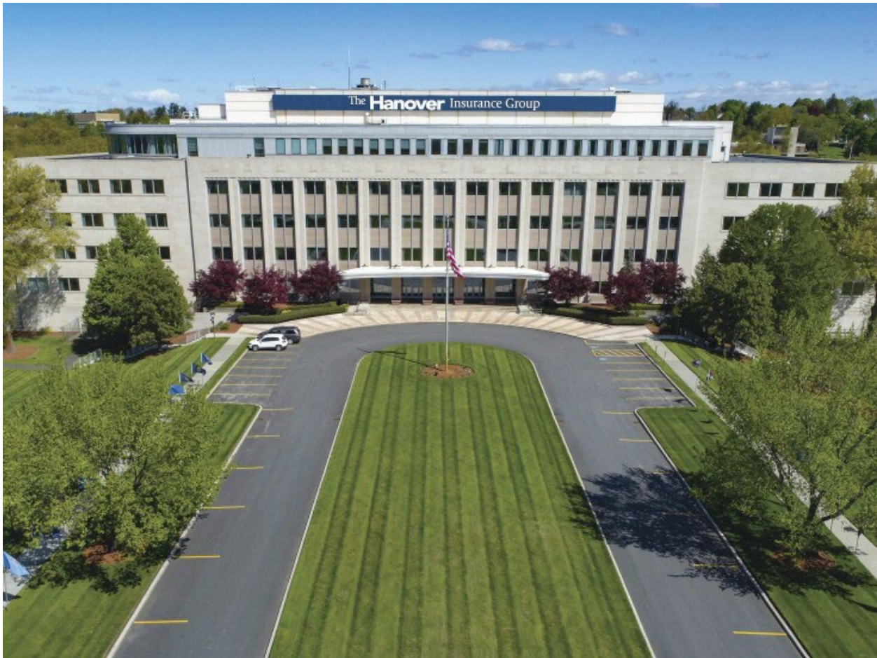
The Hanover headquarters in Worcester, Mass.

Forbes named eight property, casualty and life insurance companies as some of the best employers in its 2023 America's Best Midsize Employers list, which spans across nine industries. To determine the best of America's employers, Forbes and Statista, a market research company, surveyed around 45,000 American employees at organizations employing between 1,000 to 5,000 workers. Survey respondents ranked whether they would recommend their employer on a scale of zero to 10 and were also asked to name other employers that they would recommend to friends or family members.